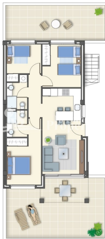
VIVIENDA 3 D - PLANTA BAJA