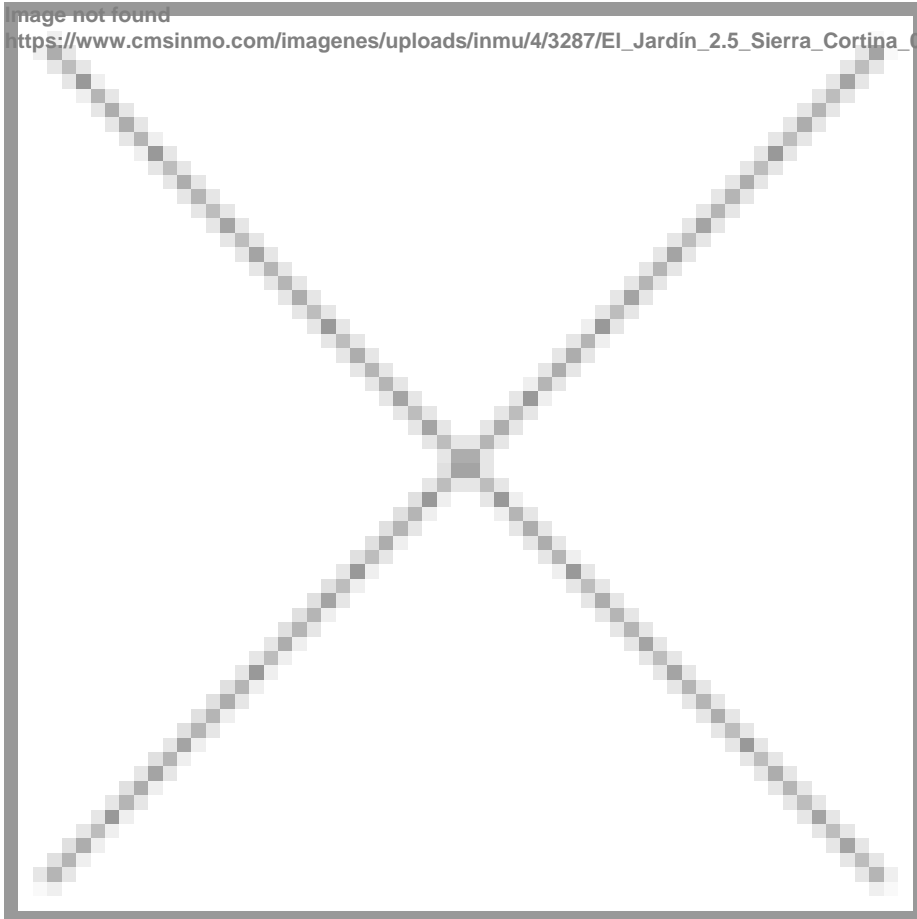
image not found https://www.cmsinmo.com/imagenes/uploads/inmu/4/3287/El_Jardín_2.5_Sierra_Cortina_03_.JPG