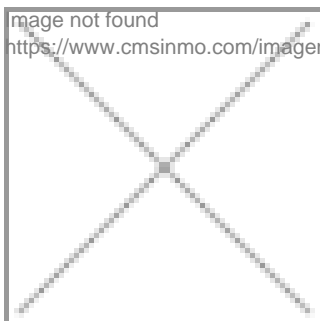
image not found https://www.cmsinmo.com/imagenes/uploads/inmu/5/6953/NEW-HEIGHTS-FRONTAL_sRGB_300P