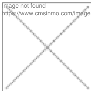
image not found https://www.cmsinmo.com/imagenes/uploads/inmu/5/6953/NEW-HEIGHTS-FRONTAL_sRGB_300P