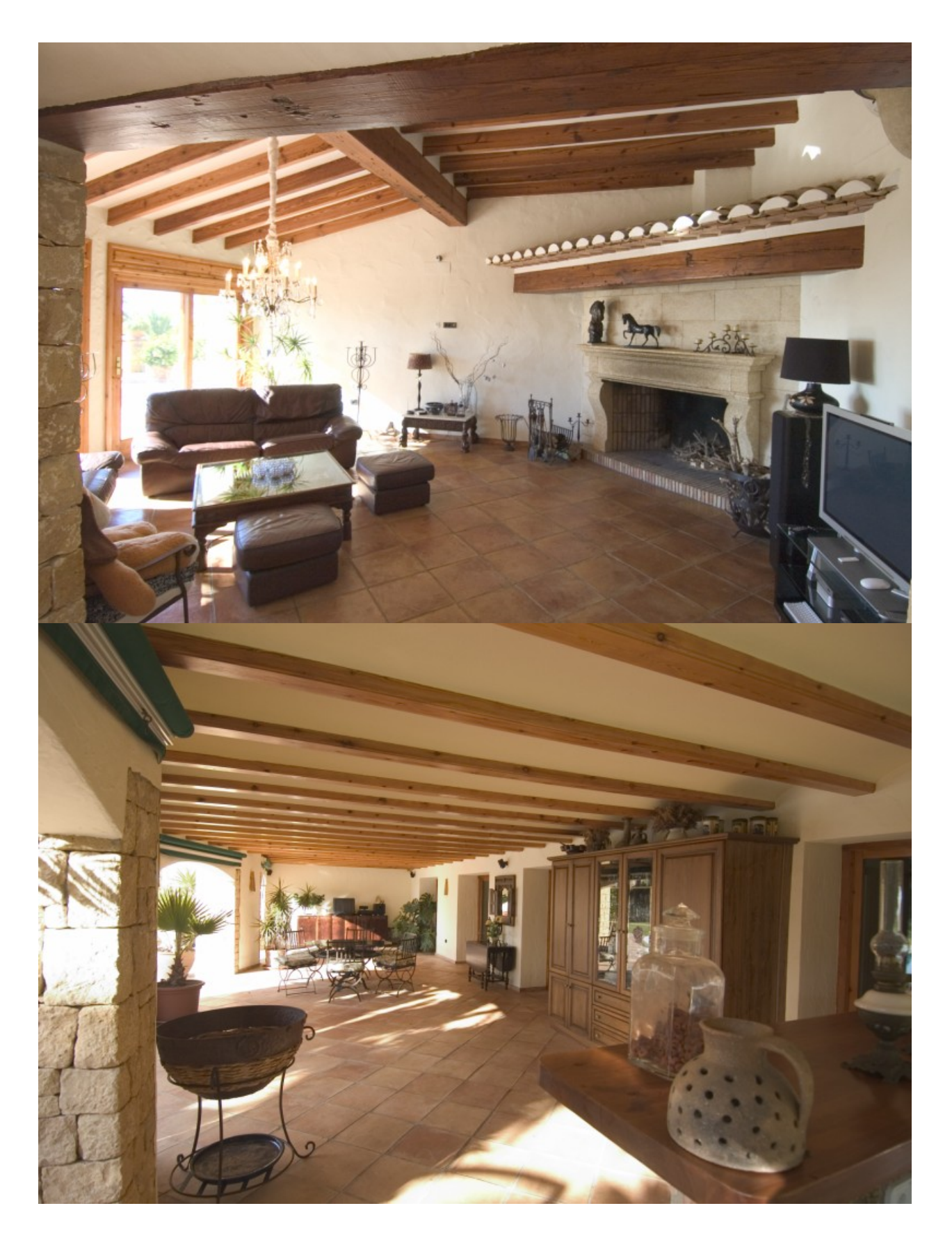
"OUR EXPERIENCE IS YOUR GUARANTEE"