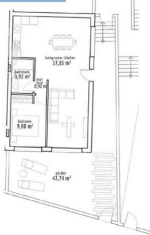
GROUND FLOOR A

1 to 3 bedrooms · Ground floors with garden · Big terraces · Underground parking · Recreational area · 2 levels cascade pool · 1 st qualities