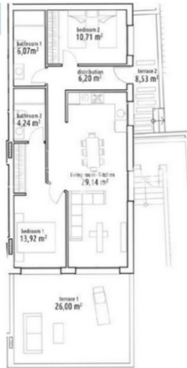
1 st FLOOR A