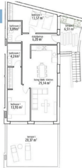
2 nd FLOOR A