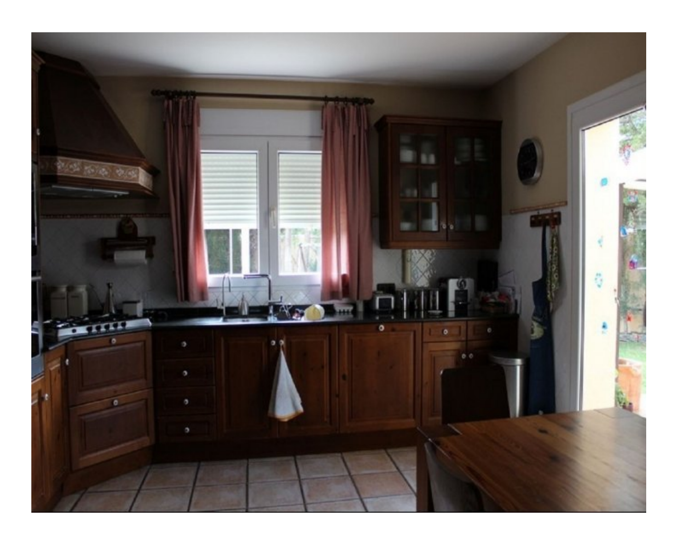
"OUR EXPERIENCE IS YOUR GUARANTEE"