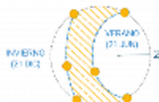
Plano de solarium/Solarium study