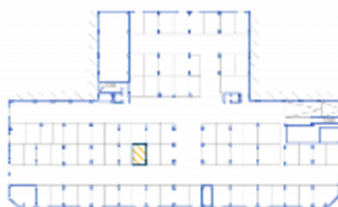
Ubicadas en Planta Garaje/Location in Parking floor