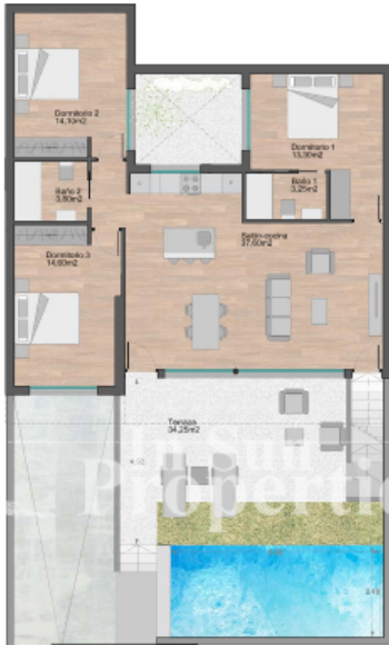
HOUSE 3 GROUND FLOOR