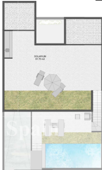
HOUSE 3 SOLARIUM