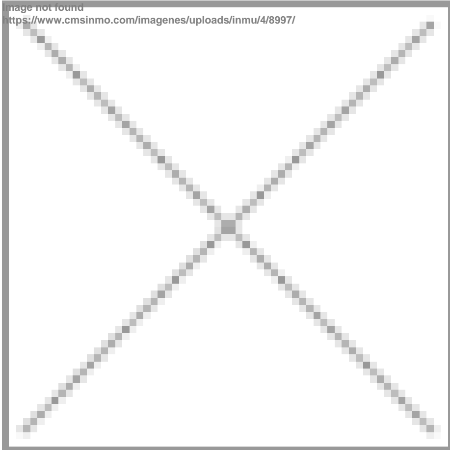
Image not found https://www.cmsinmo.com/imagenes/uploads/inmu/4/8997/